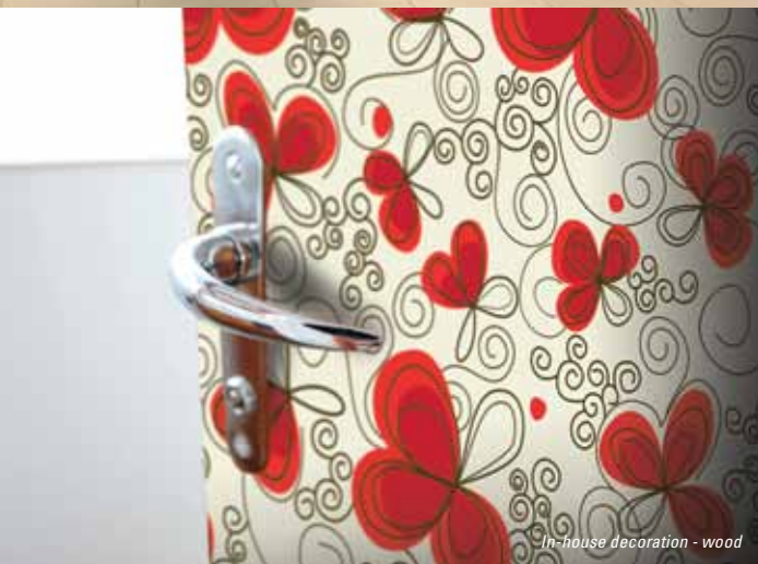
In-house decoration - wood