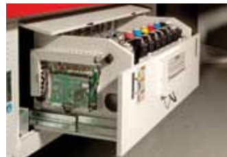
Ink control tray