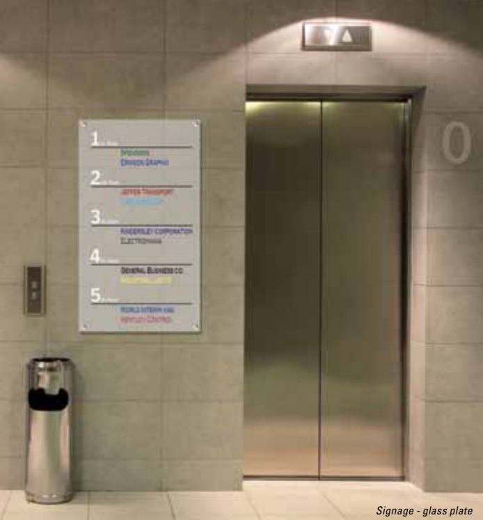
Signage - glass plate