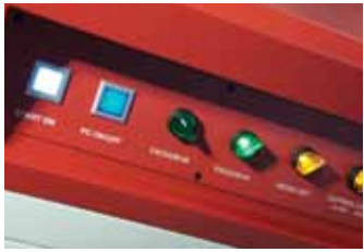
Easy to use operator panel