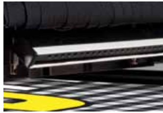
Shuttle safety sensors